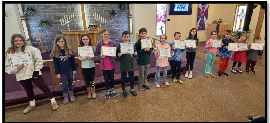
Perfect Attendance Awards