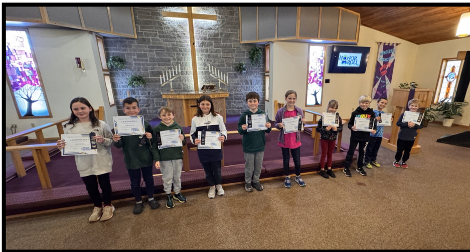
"A-B" Honor Roll Students