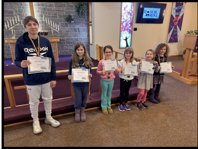
"A" Honor Roll Students

Congratulations to the students who received awards for 2nd trimester!